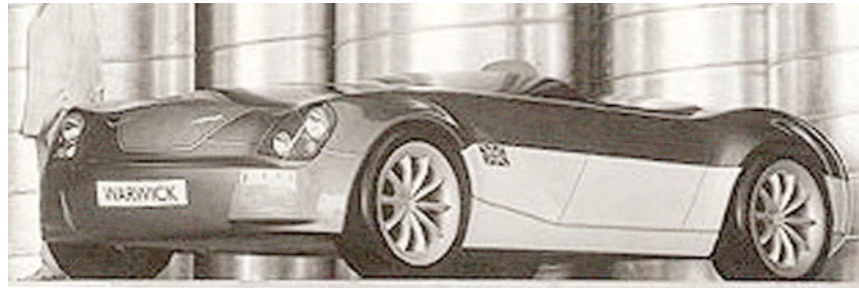
Volume 19, No. 6